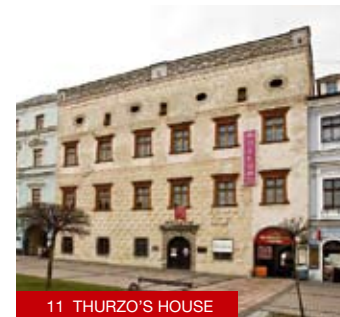
11 THURZO'S HOUSE