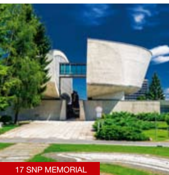
17 SNP MEMORIAL

20 Bethlen's house is known for the meeting of the Hungarian Diet in 1620 held in the house that named Transylvania Prince Gabriel Bethlen as the King of Hungary. Today the building is home to the Central Slovakia Gallery and hosts a wide range of exhibitions, primarily focused on modern and contemporary art. www.ssgbb.sk