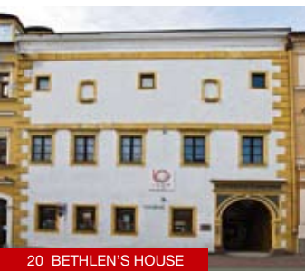
20 BETHLEN'S HOUSE