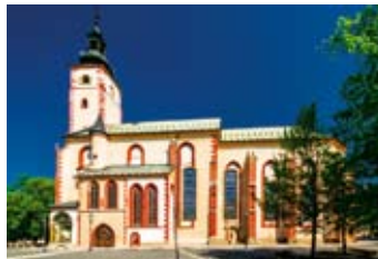
6 THE CHURCH OF THE VIRGIN MARY'S ASCENSION