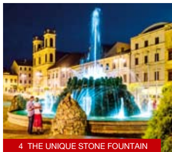
4 THE UNIQUE STONE FOUNTAIN