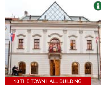
10 THE TOWN HALL BUILDING